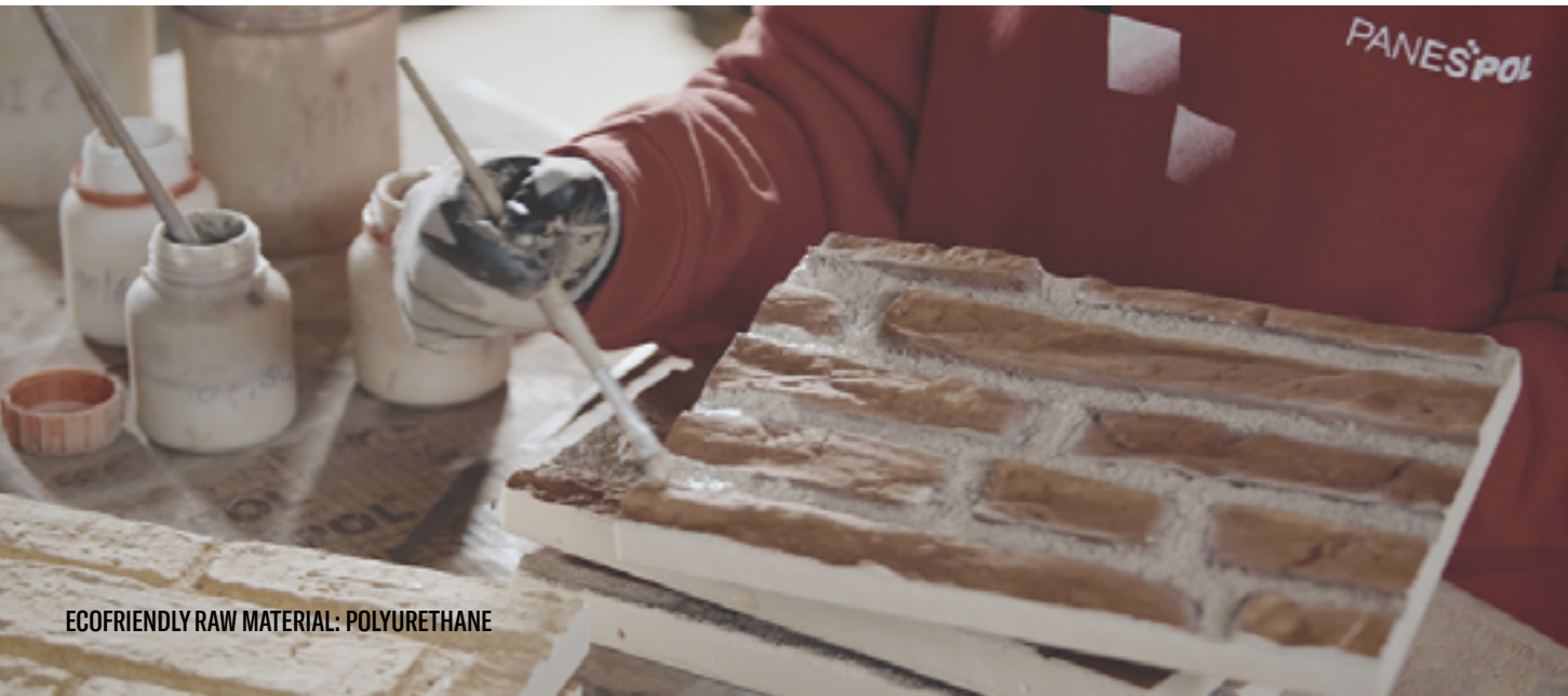
ECOFRIENDLY RAW MATERIAL: POLYURETHANE

The quality of indoor air in buildings determines the health and well-being of its occupants, which is why it has become one of the main issues on the European Commission's agenda.